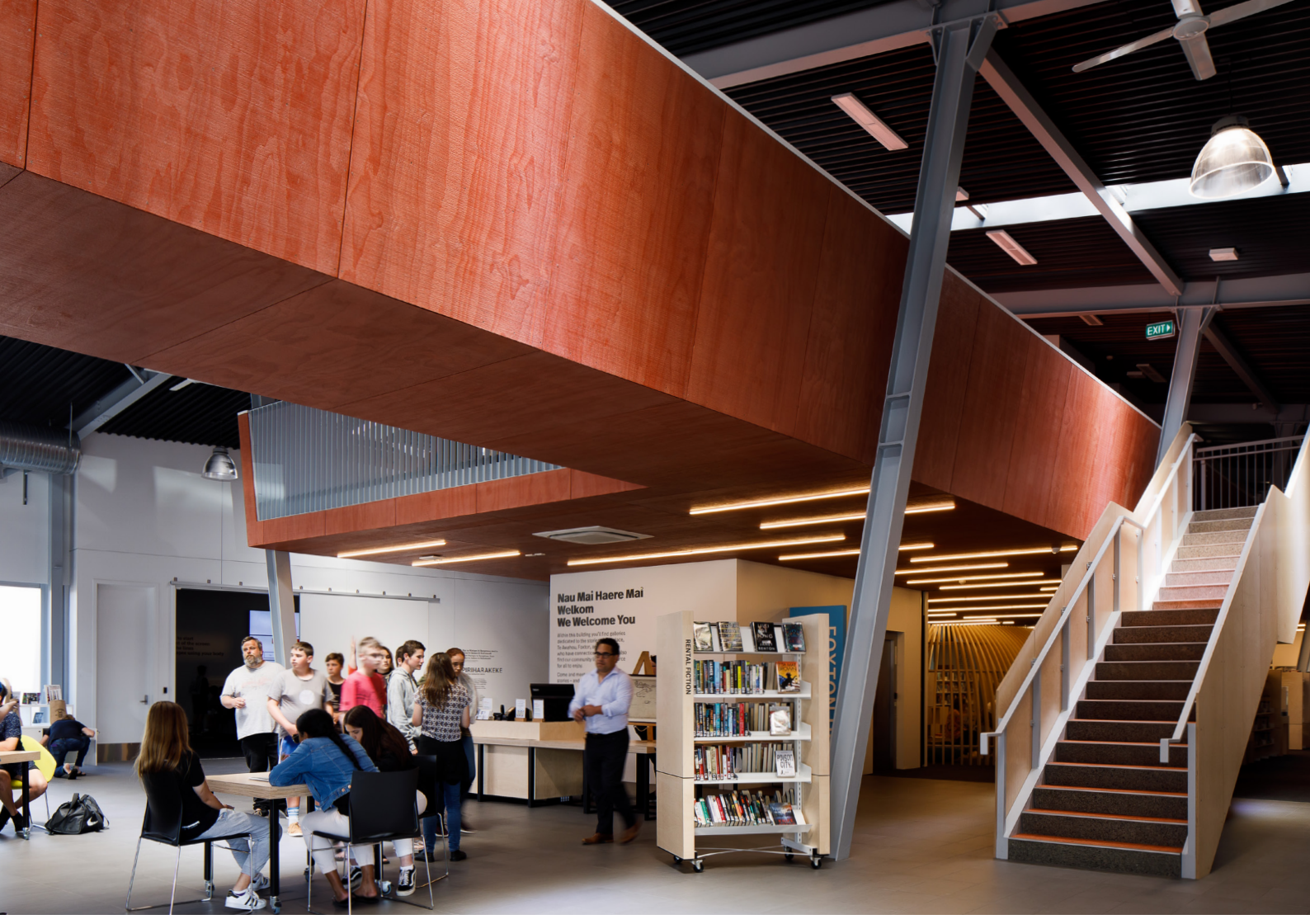
Te Awahou Nieuwe Stroom