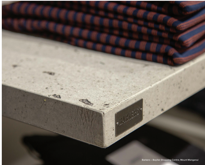
Barkers – Bayfair Shopping Centre, Mount Manganui

Regarding LightBeton Anthracite, we recommend covering the surface with paper as it has a matt surface