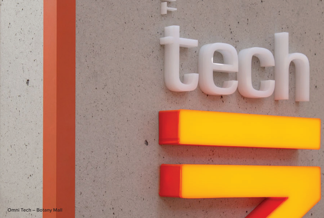
Omni Tech – Botany Mall